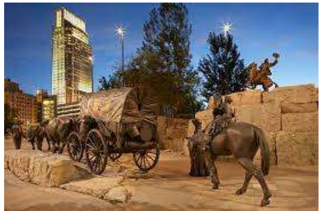
Pioneer Courage Park

Coast District, listed on the National Register of Historic Places; a 1903 Scottish Castle; Blackstone Hotel, the birthplace of the Reuben sandwich; St. Cecilia Cathedral; TD Ameritrade Park Omaha, home of the annual NCAA Men's College World Series; Omaha Community Playhouse, the theater where actor Henry Fonda started his acting career; and Hollywood Candy, filled wall-to-wall with retro candy. Groups will also have an opportunity to experience Pioneer Courage Park . The park features more than 100 larger-than-life sized bronze sculptures that tell the story of the pioneer's westward journey